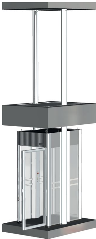
Shaft and door: